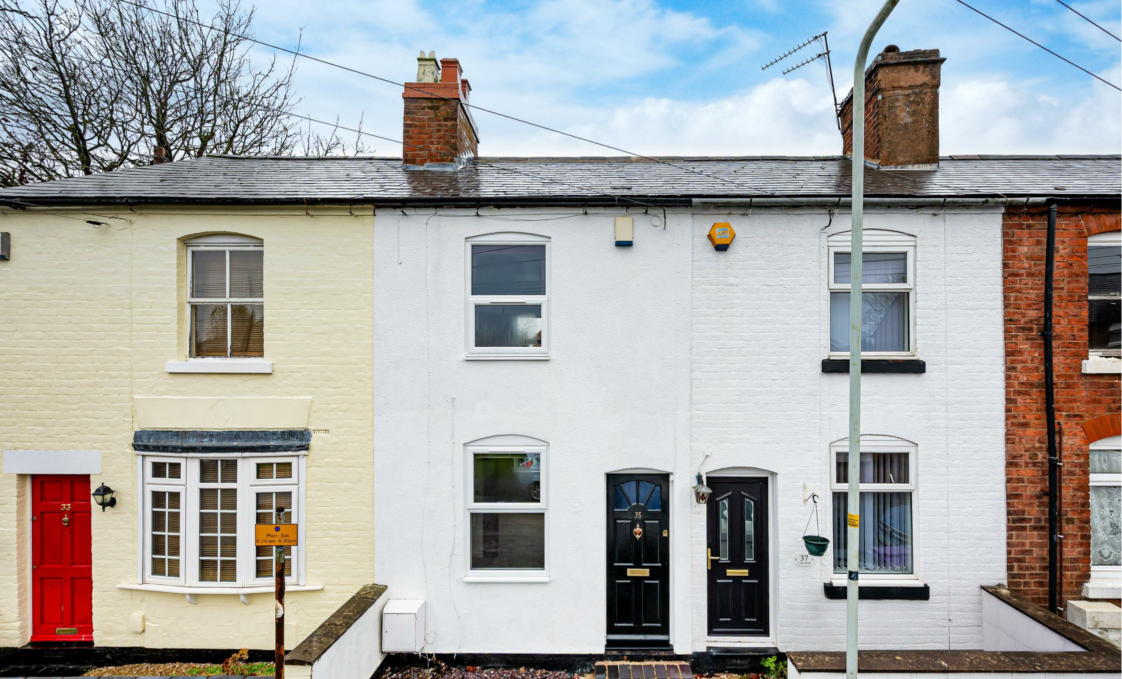
35 Limes Road, Tettenhall, Wolverhampton, WV6 8RD