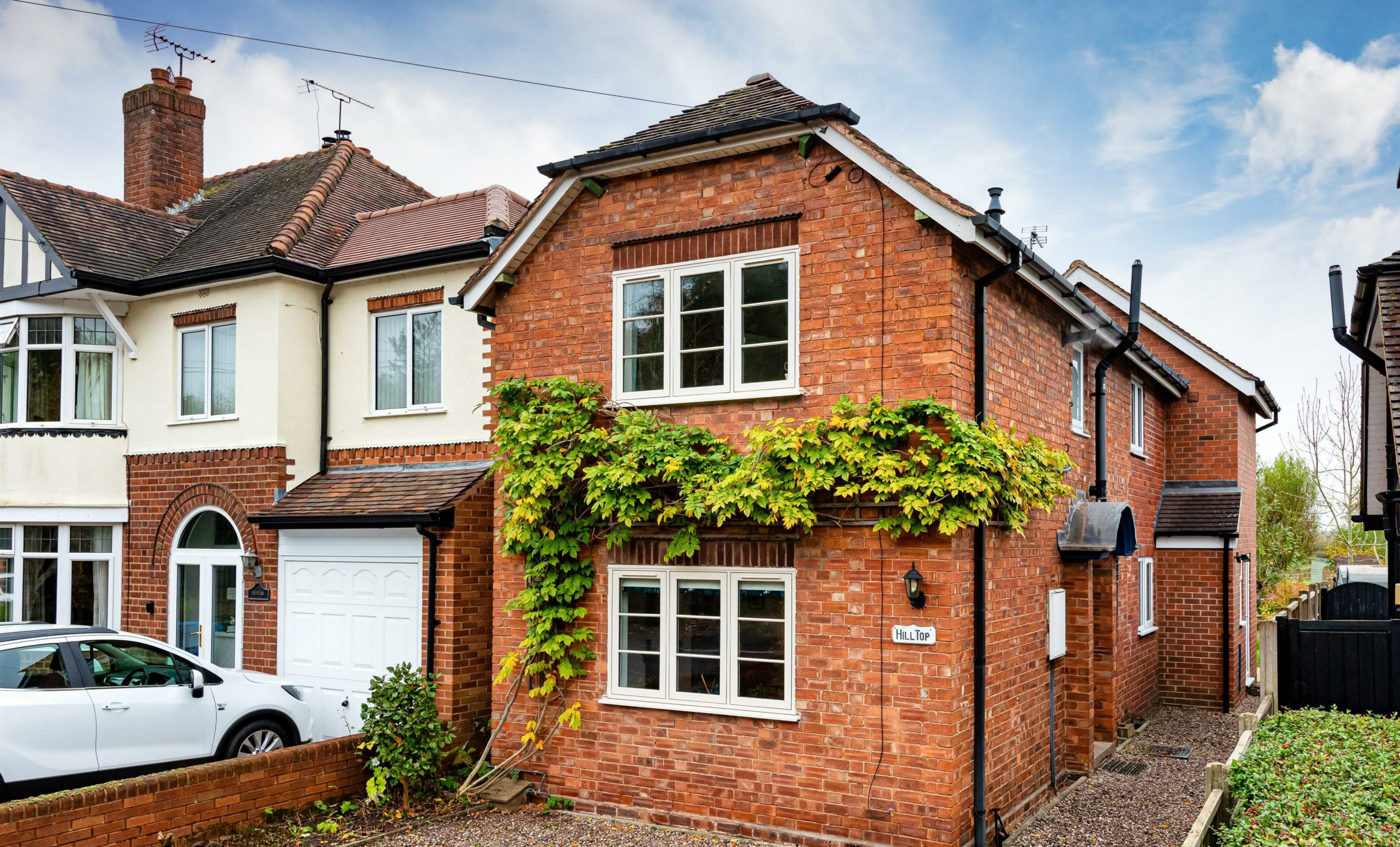
Hilltop, Coven Road, Brewood, Stafford, ST19 9DF