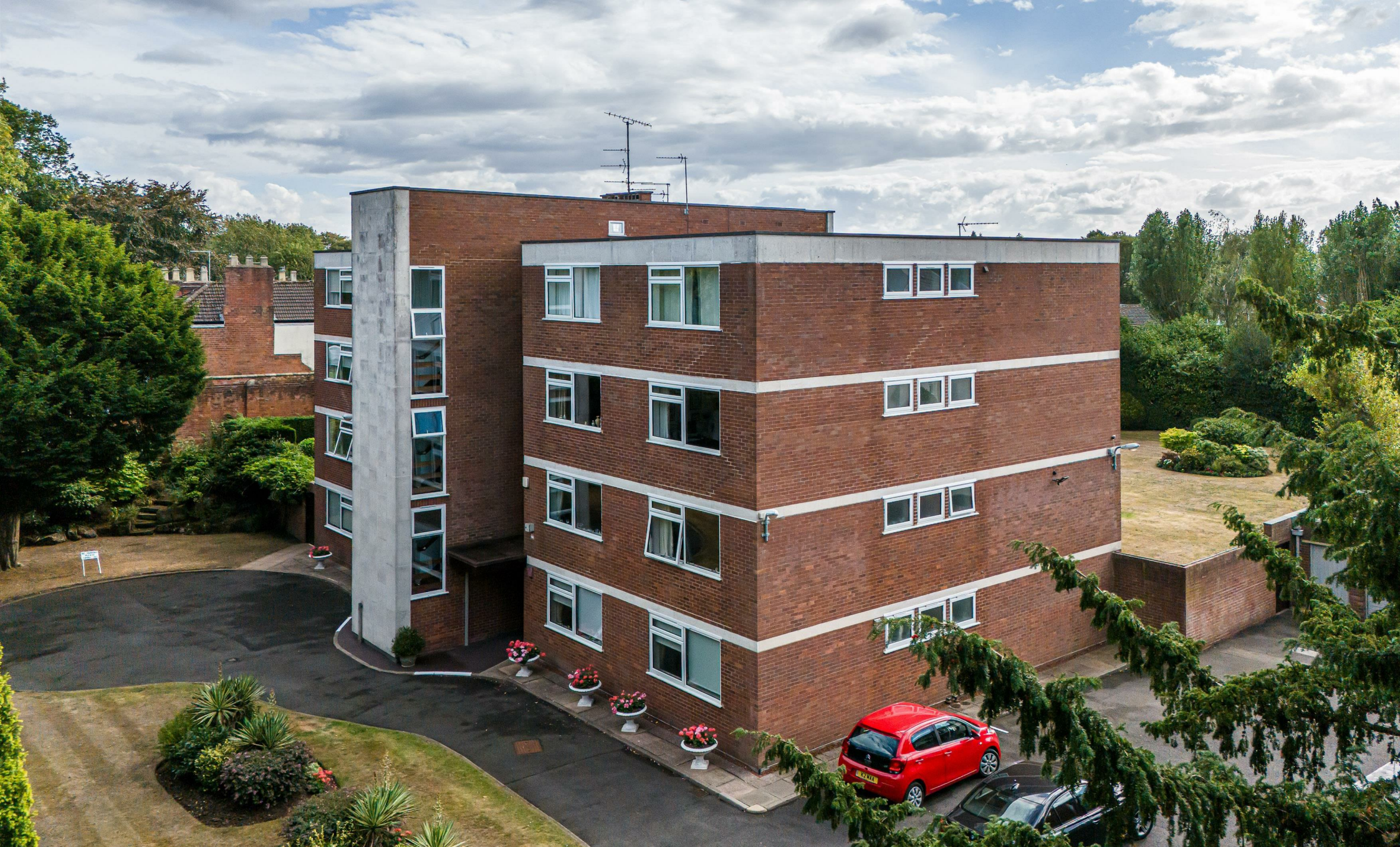
Flat 6 The Manor House Upper Green, Wolverhampton, WV6 8QJ