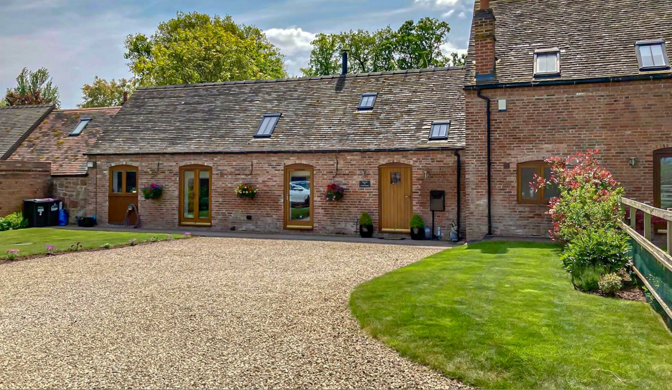
Wentworth Barn, 2 Patshull Gardens, Albrighton, Wolverhampton, WV7 3BG