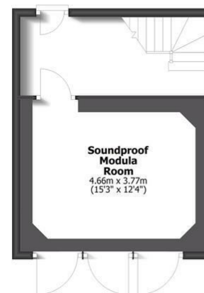
Barn - Ground Floor