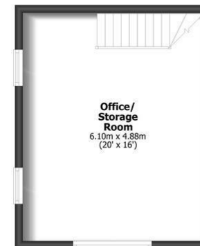
Barn - First Floor