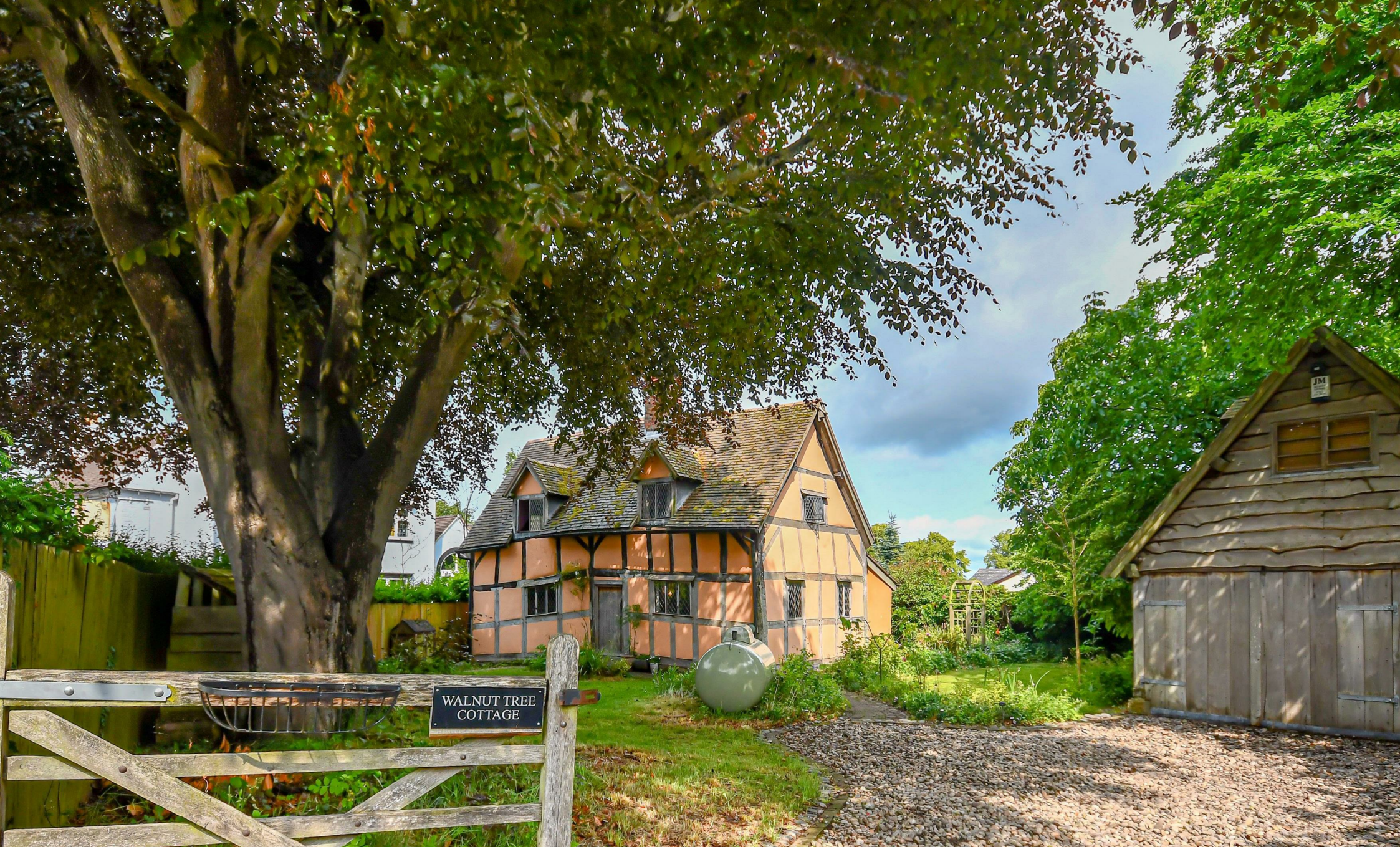
Walnut Tree Cottage Springhill Lane, Lower Penn, Wolverhampton, South Staffordshire, WV4 4UF