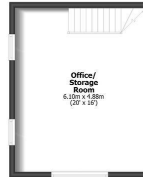
Barn - First Floor