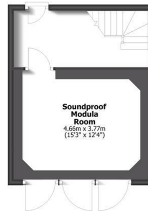
Barn - Ground Floor