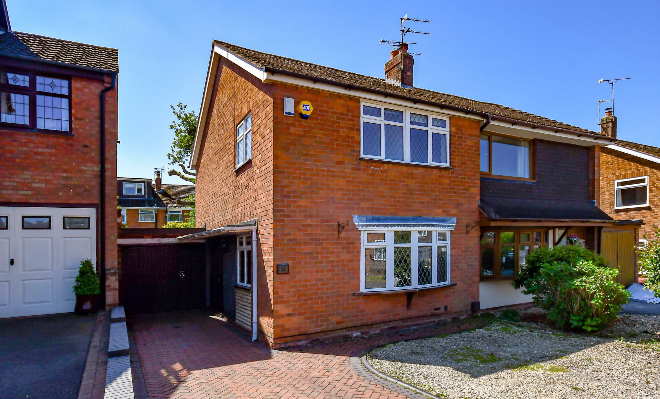
12 Calvin Close, Wombourne, Wolverhampton, South Staffordshire, WV5 0DF