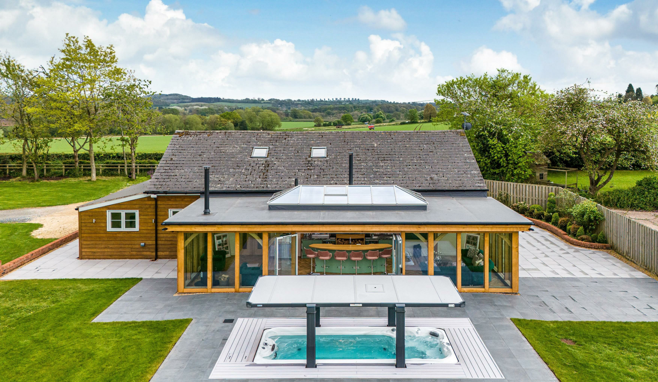
The Old Village Hall, Stanlow, Pattingham, Wolverhampton, Shropshire, WV6 7DY