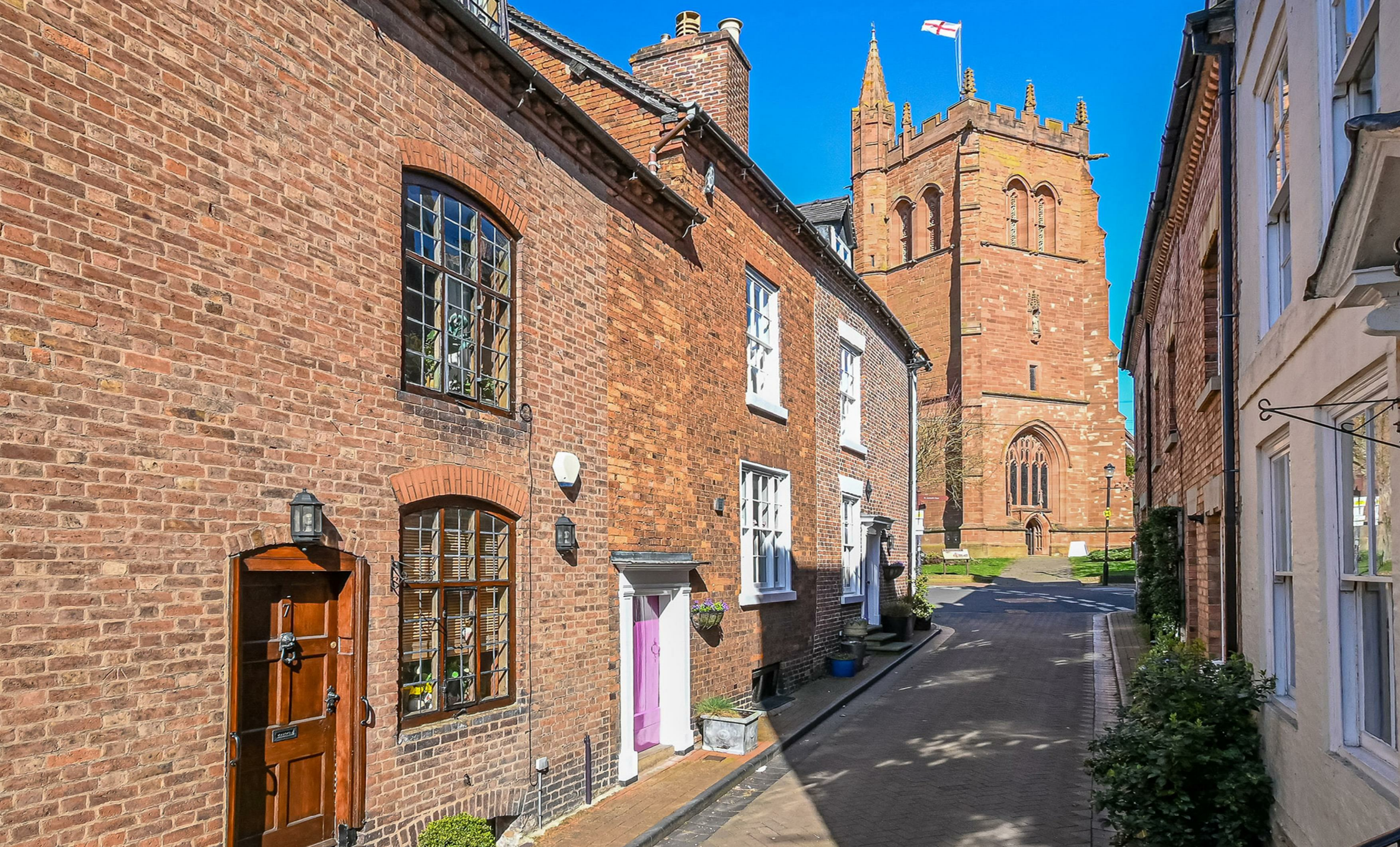
7 Church Street, Bridgnorth, Shropshire, WV16 4EQ