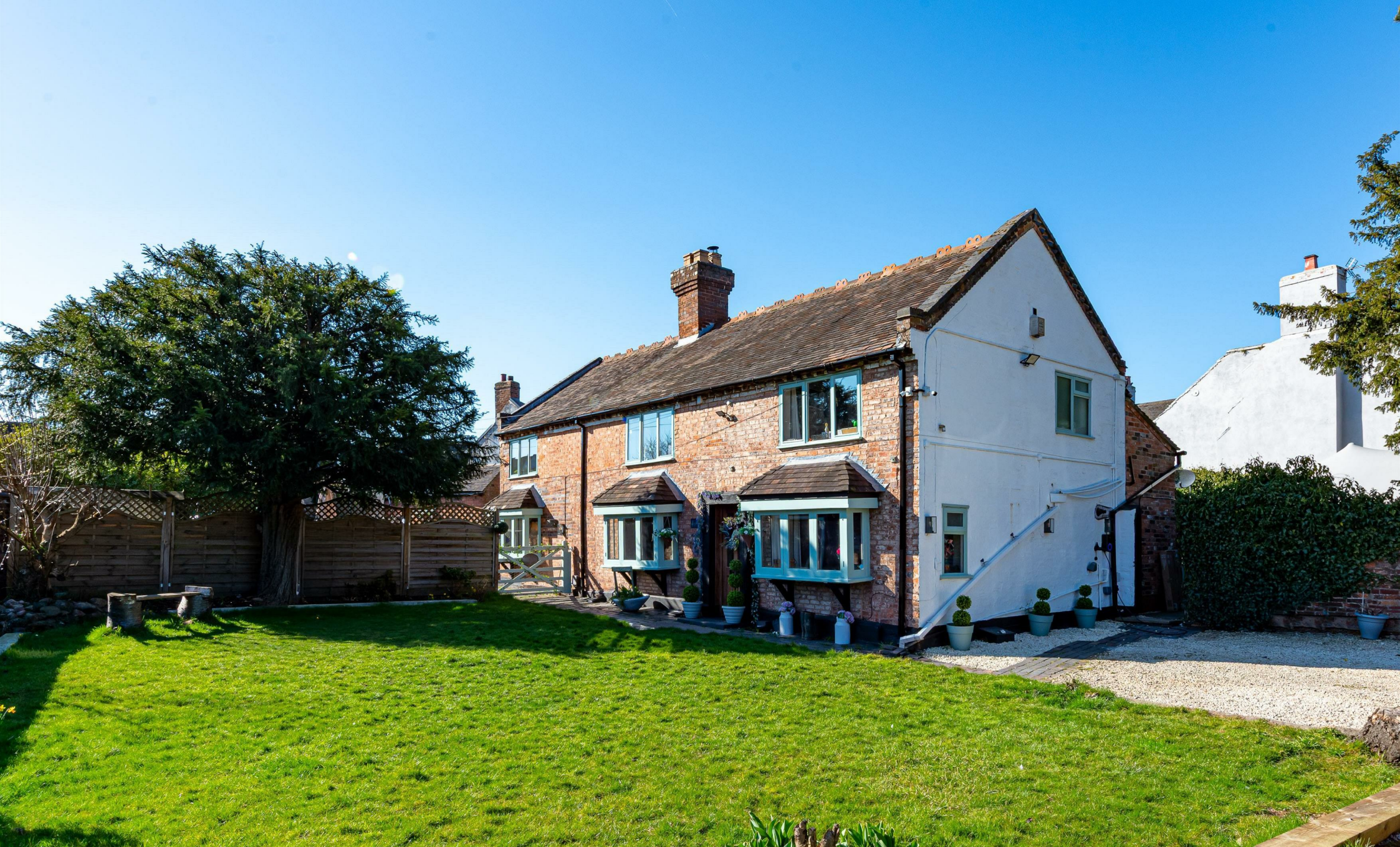
Elms Cottage, 4 Elms Lane, Shareshill, Wolverhampton, WV10 7JS