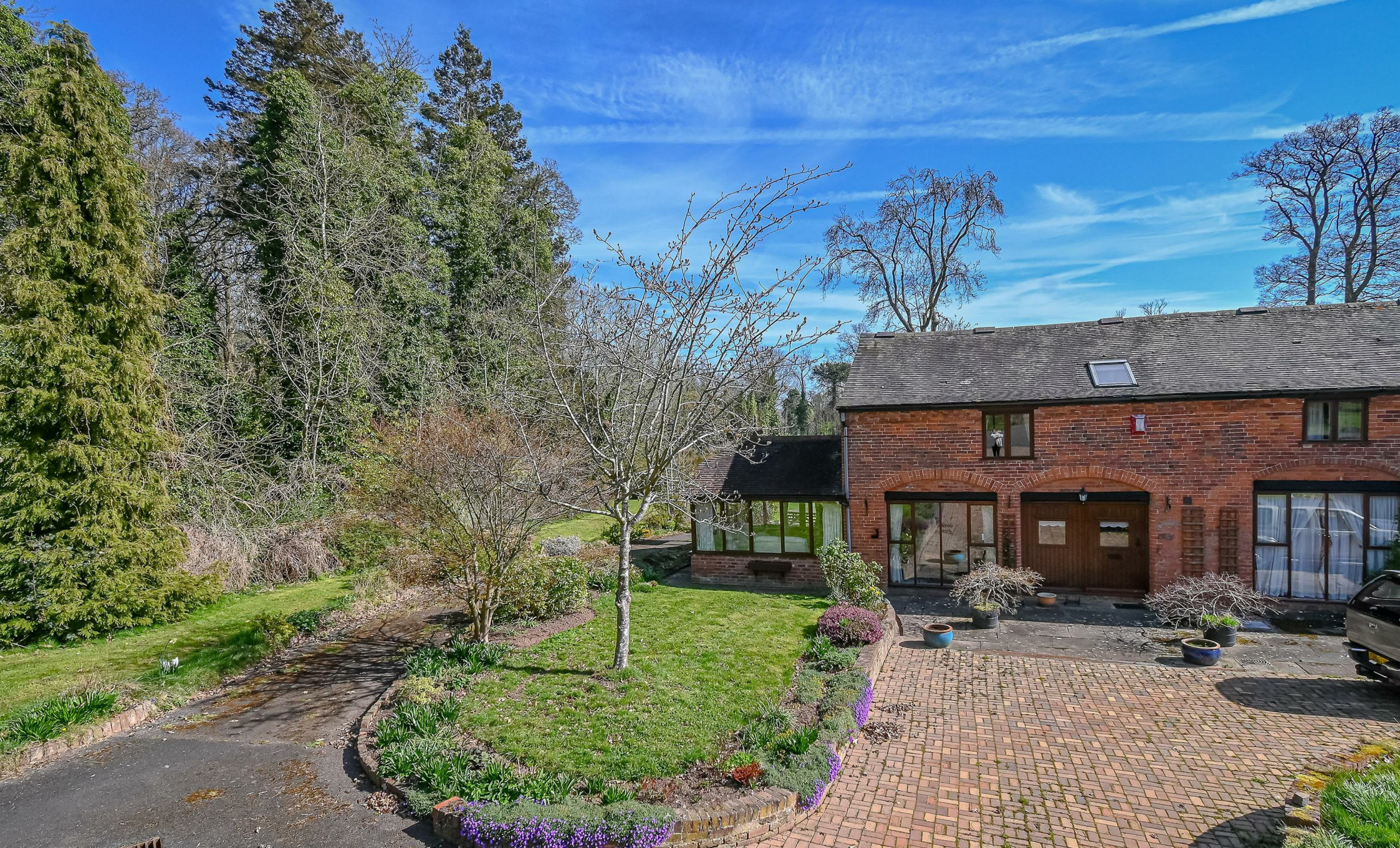
The Mill Gatacre, Claverley, Shropshire, WV5 7AW