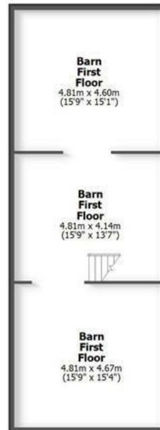
Barn First Floor