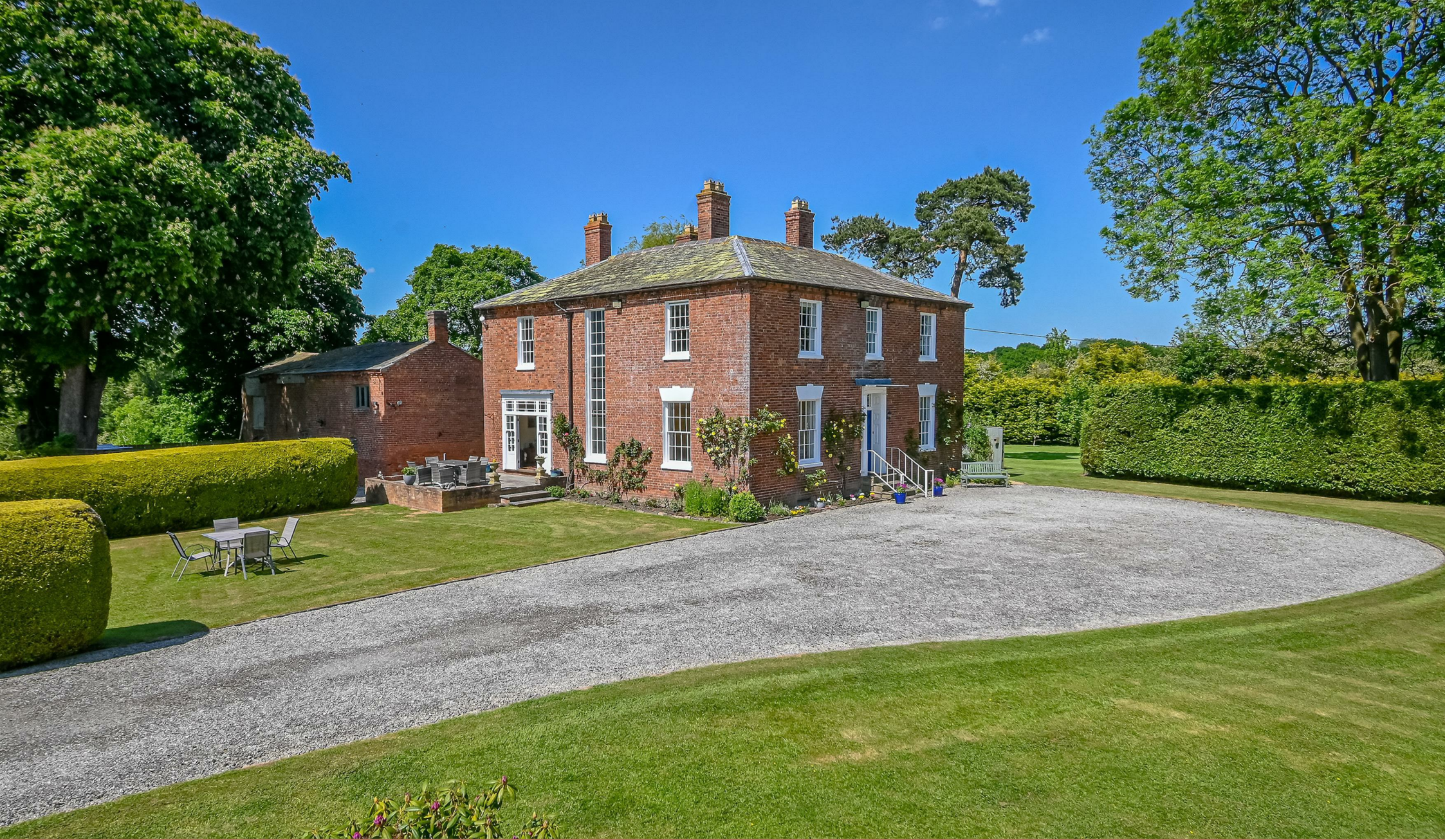
Manor House, Hughley, Shrewsbury, SY5 6NT