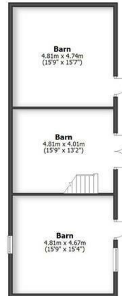
Barns & Stables