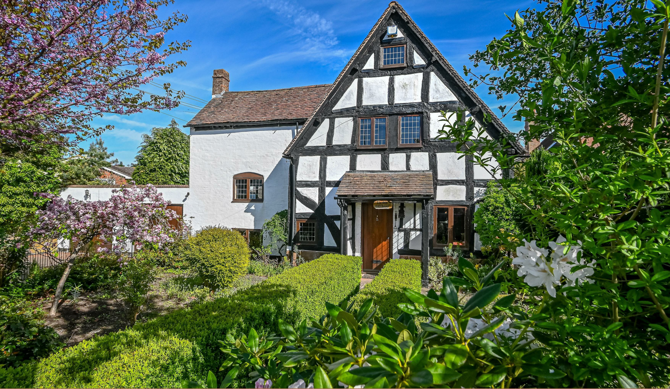
The Old Malthouse, Hilton, Bridgnorth, Shropshire, WV15 5PJ