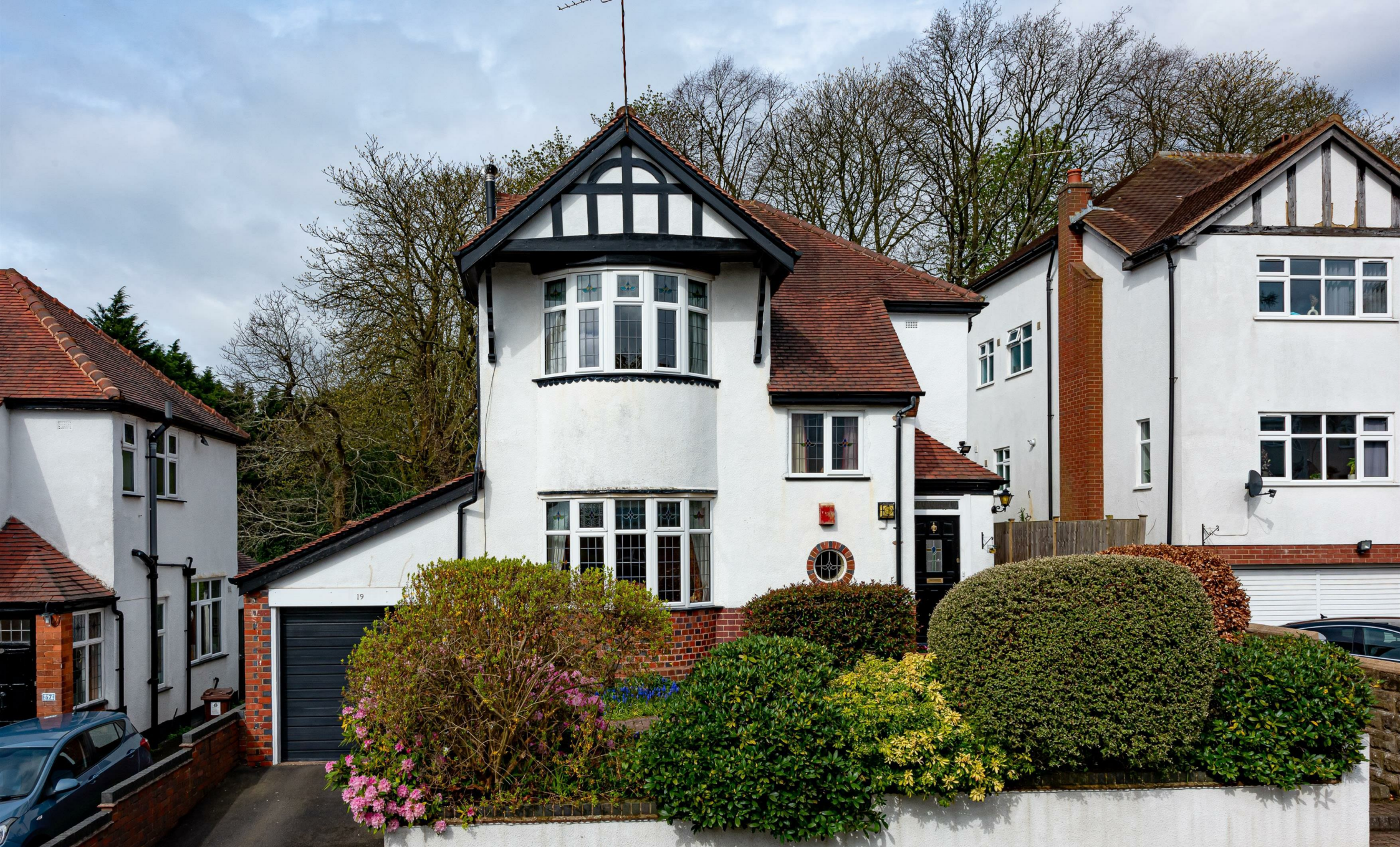
19 Tudor Crescent, Wolverhampton, WV2 4PX