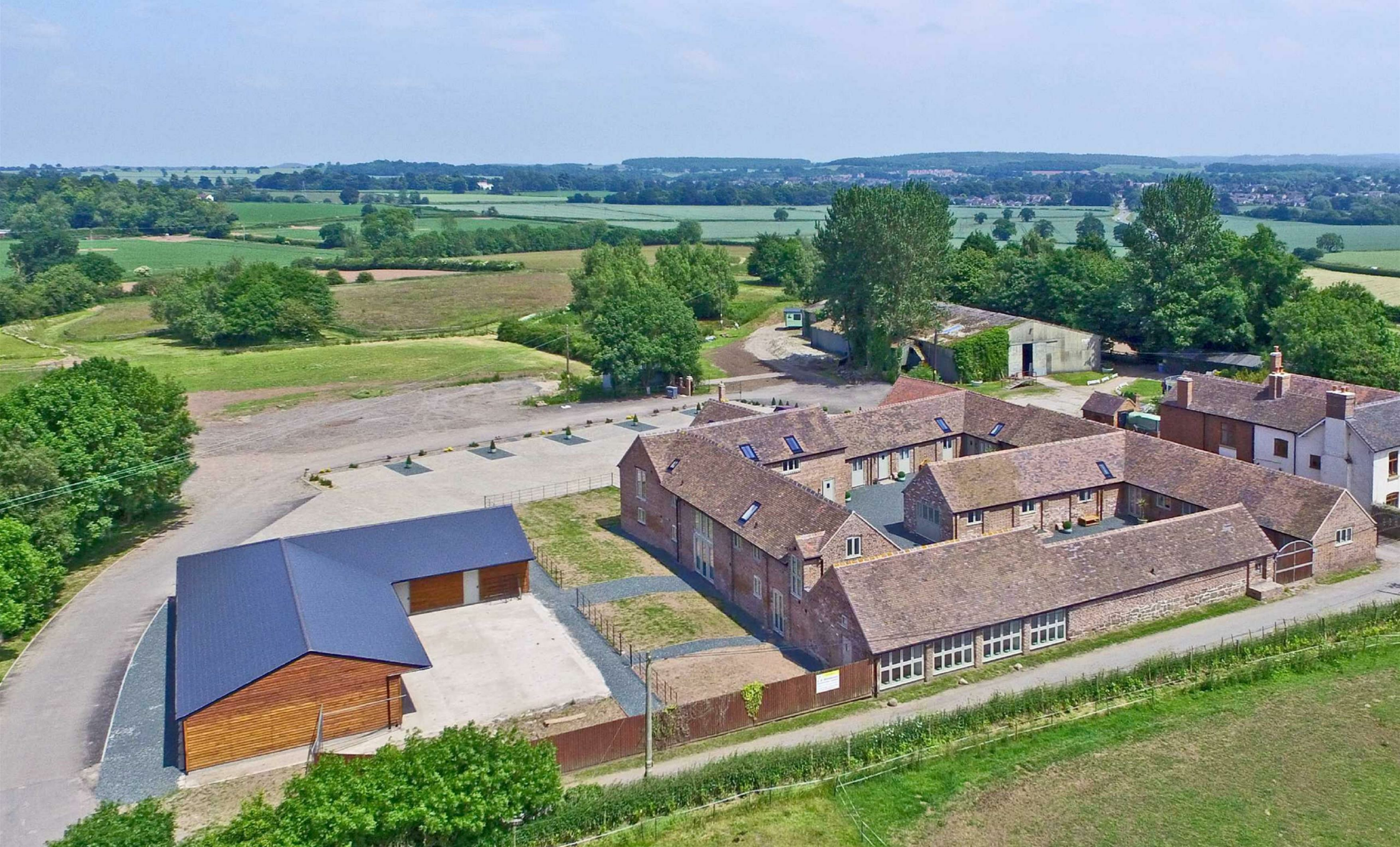
Saxon Meadow Cottage, 5 The Wyke, Shifnal, Shropshire, TF11 9PP