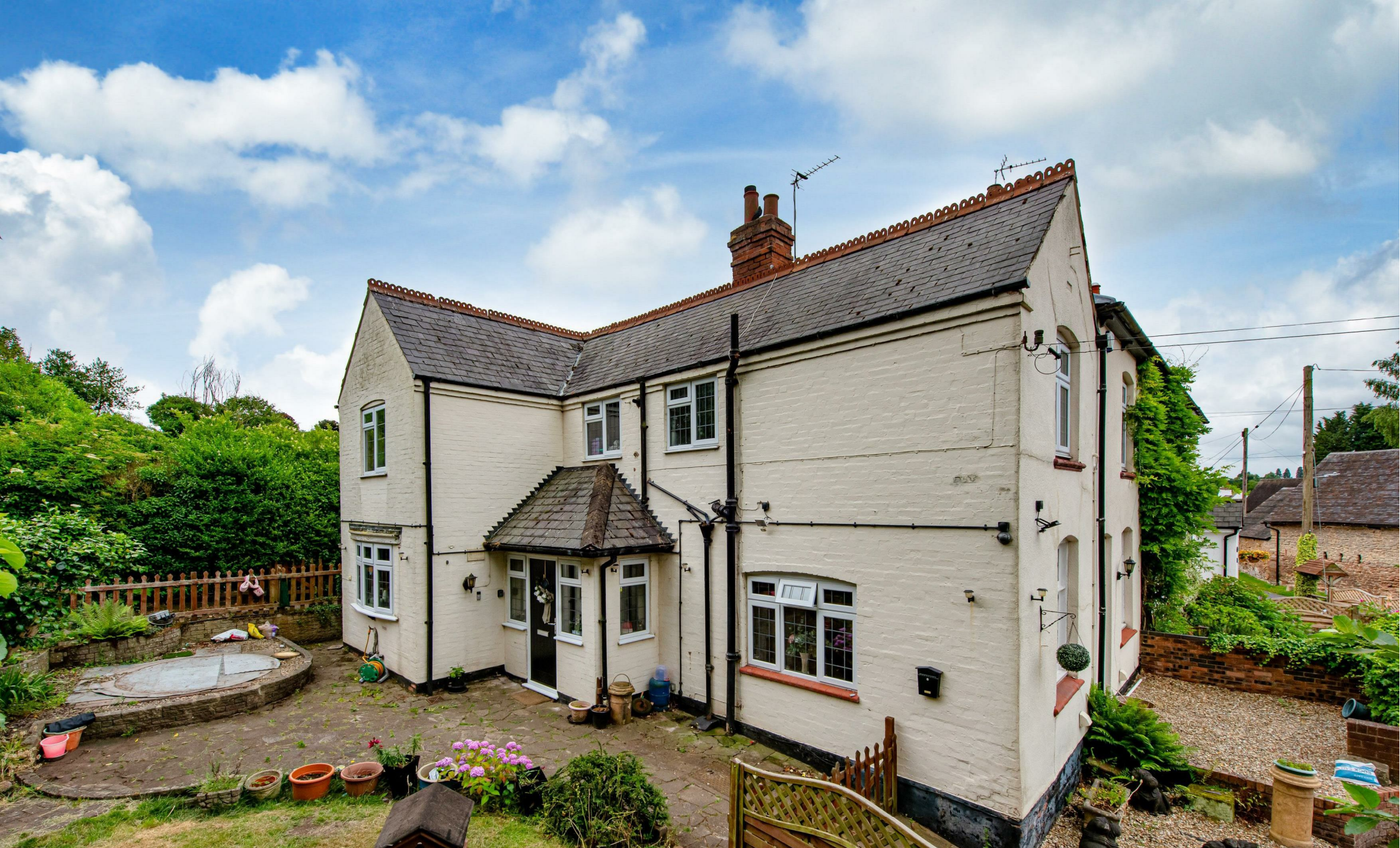
1 & 2 New Cottages Oaken Lane, Oaken, Wolverhampton, WV8 2BD