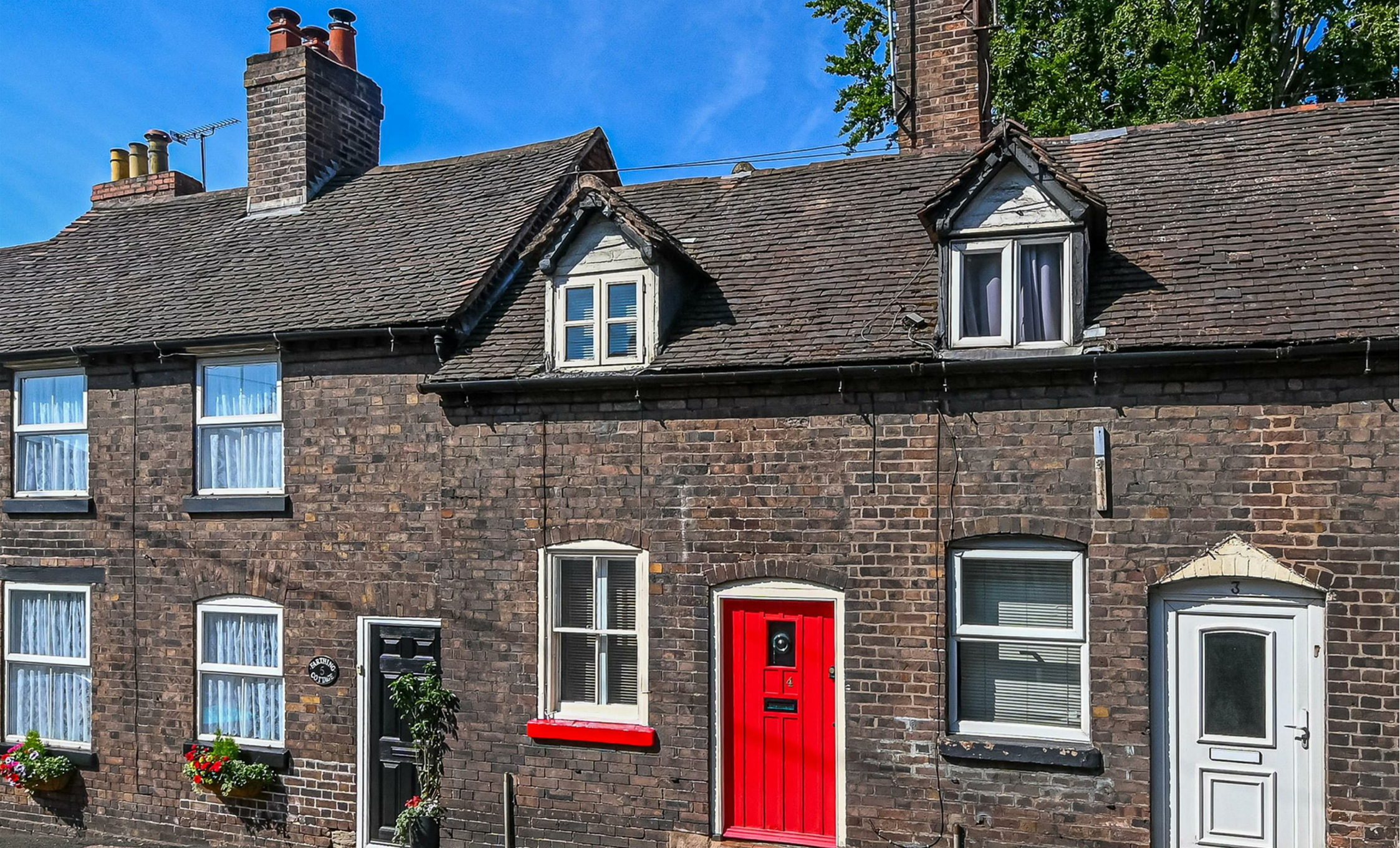
4 Pound Street, Bridgnorth, Shropshire, WV16 4AP