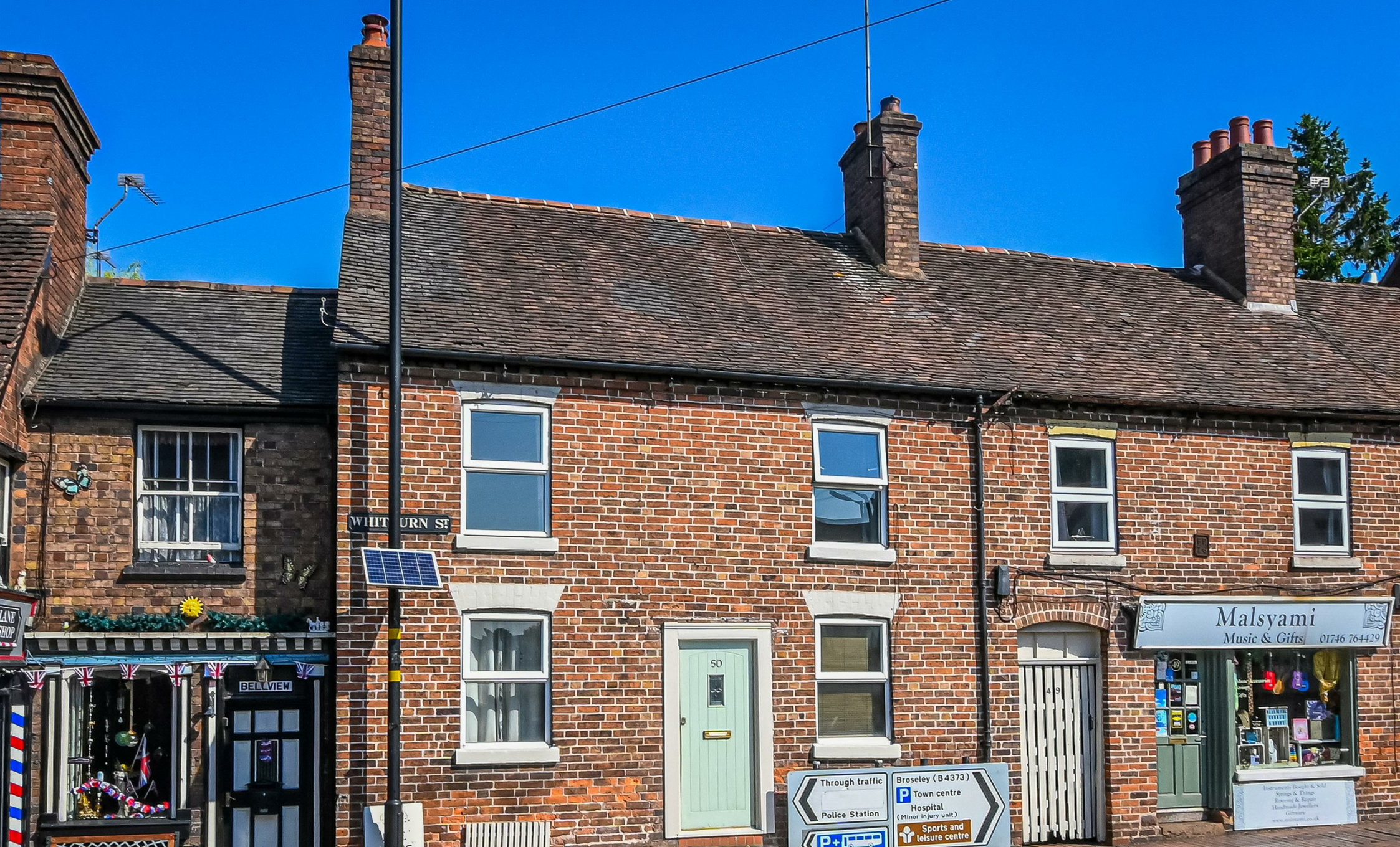
50 Whitburn Street, Bridgnorth, Shropshire, WV16 4QT