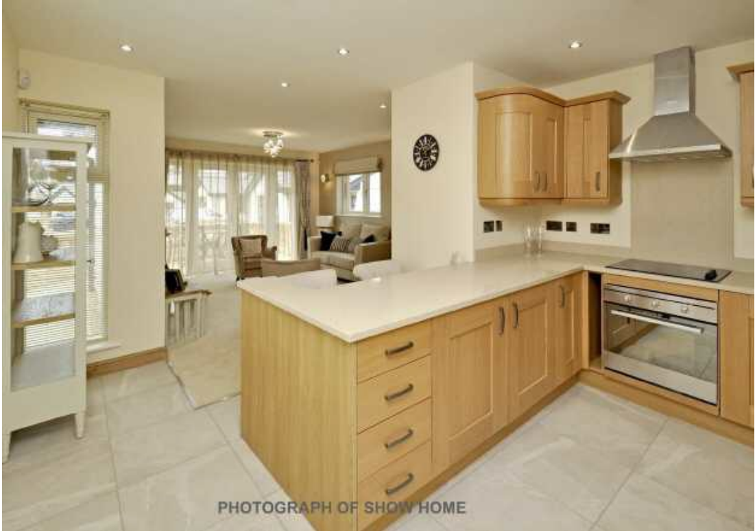
PHOTOGRAPH OF SHOW HOME