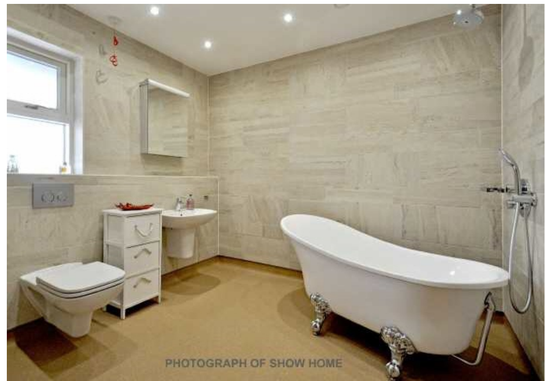
PHOTOGRAPH OF SHOW HOME