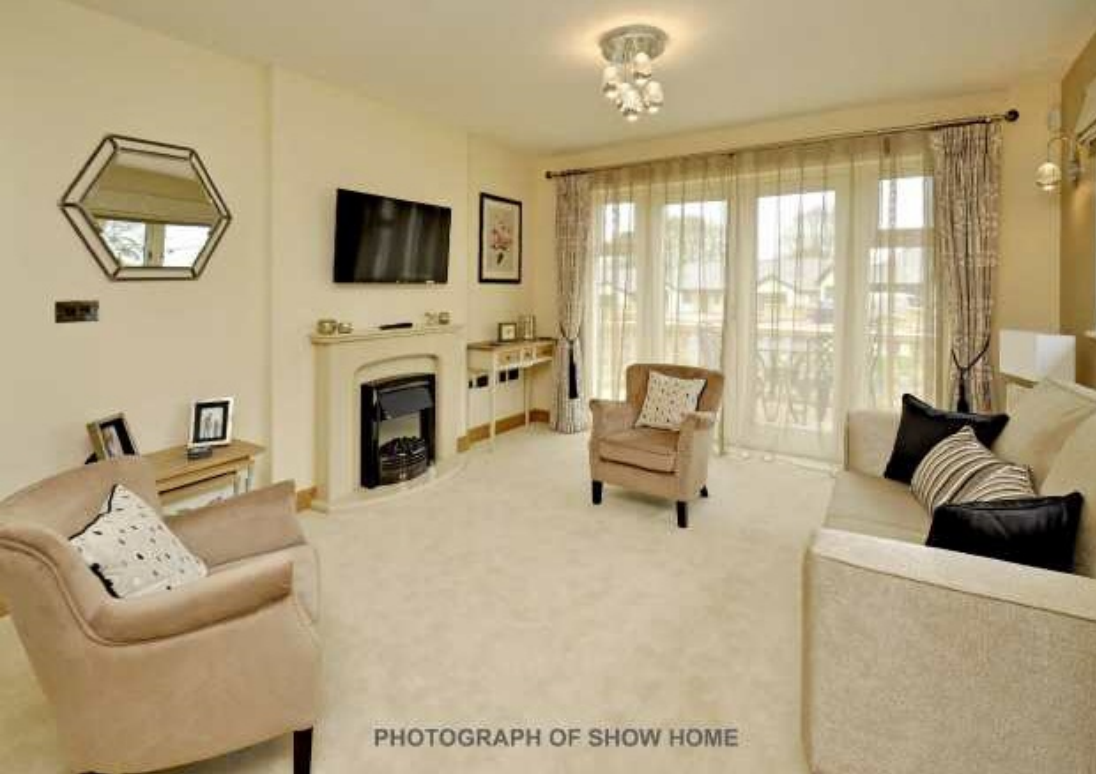
PHOTOGRAPH OF SHOW HOME