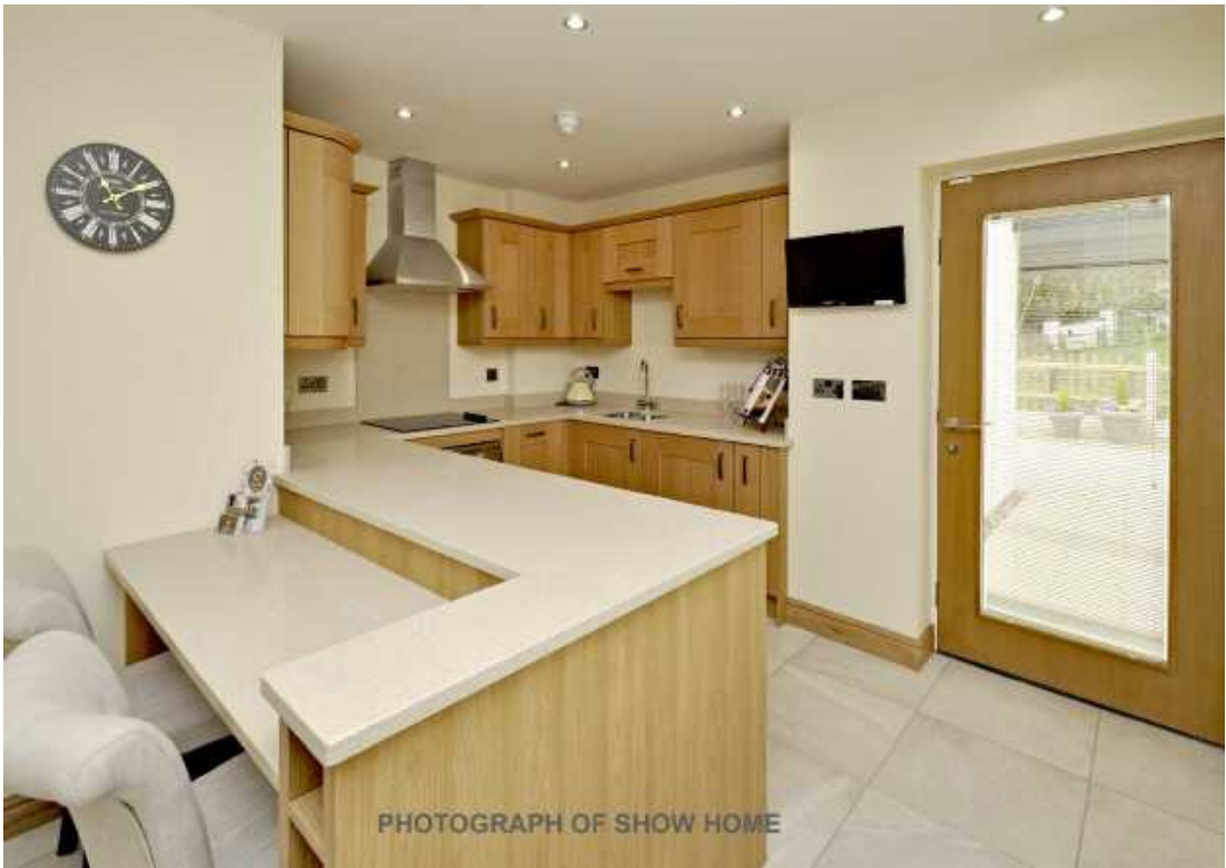
PHOTOGRAPH OF SHOW HOME