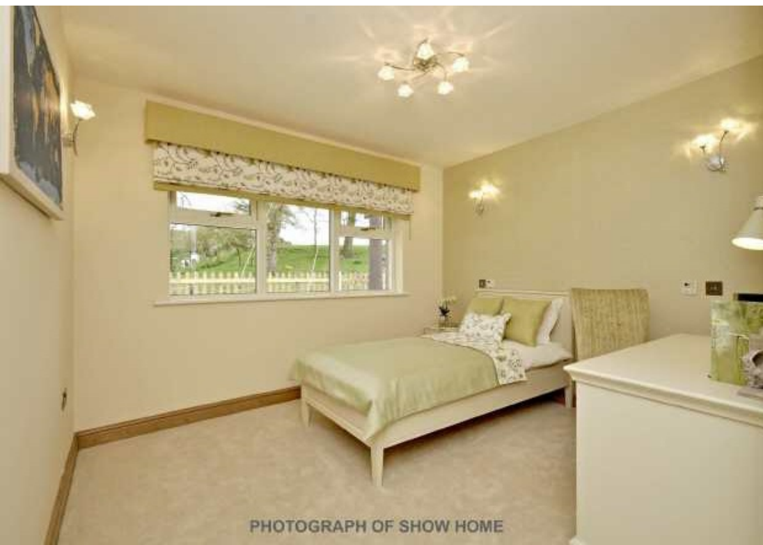
PHOTOGRAPH OF SHOW HOME