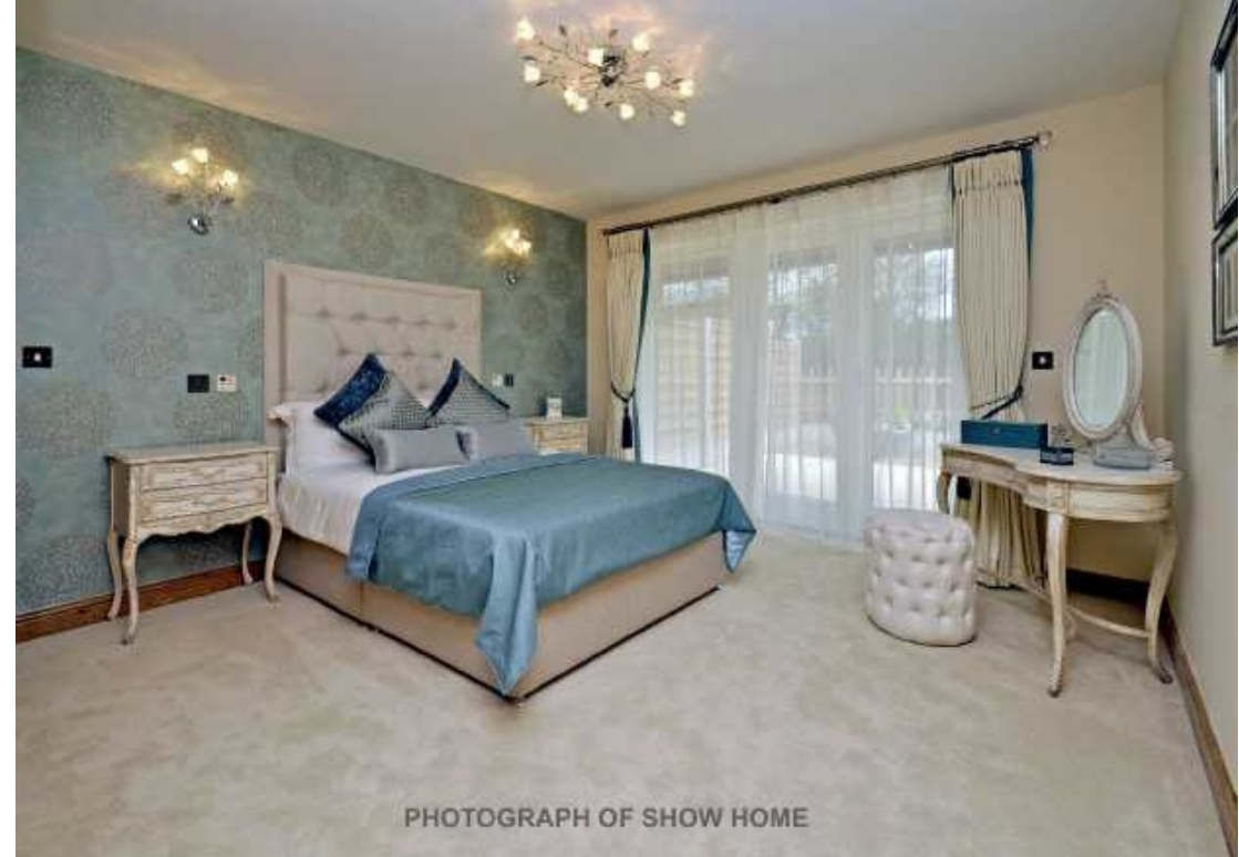
PHOTOGRAPH OF SHOW HOME