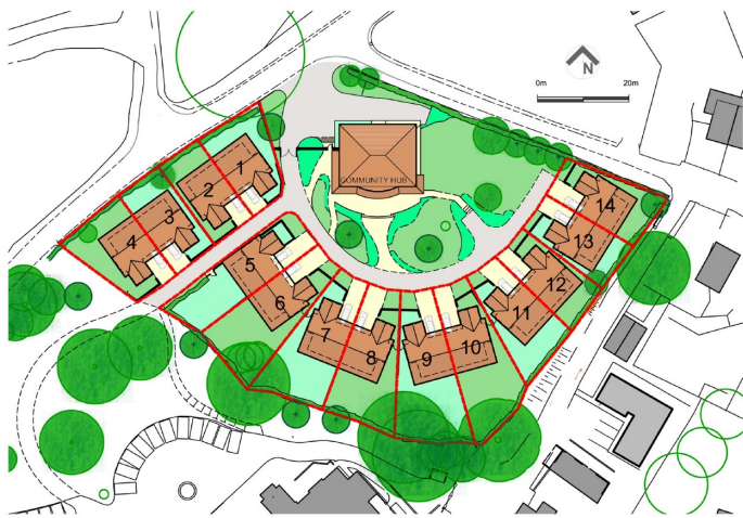
Bradeney Drive Site Plan