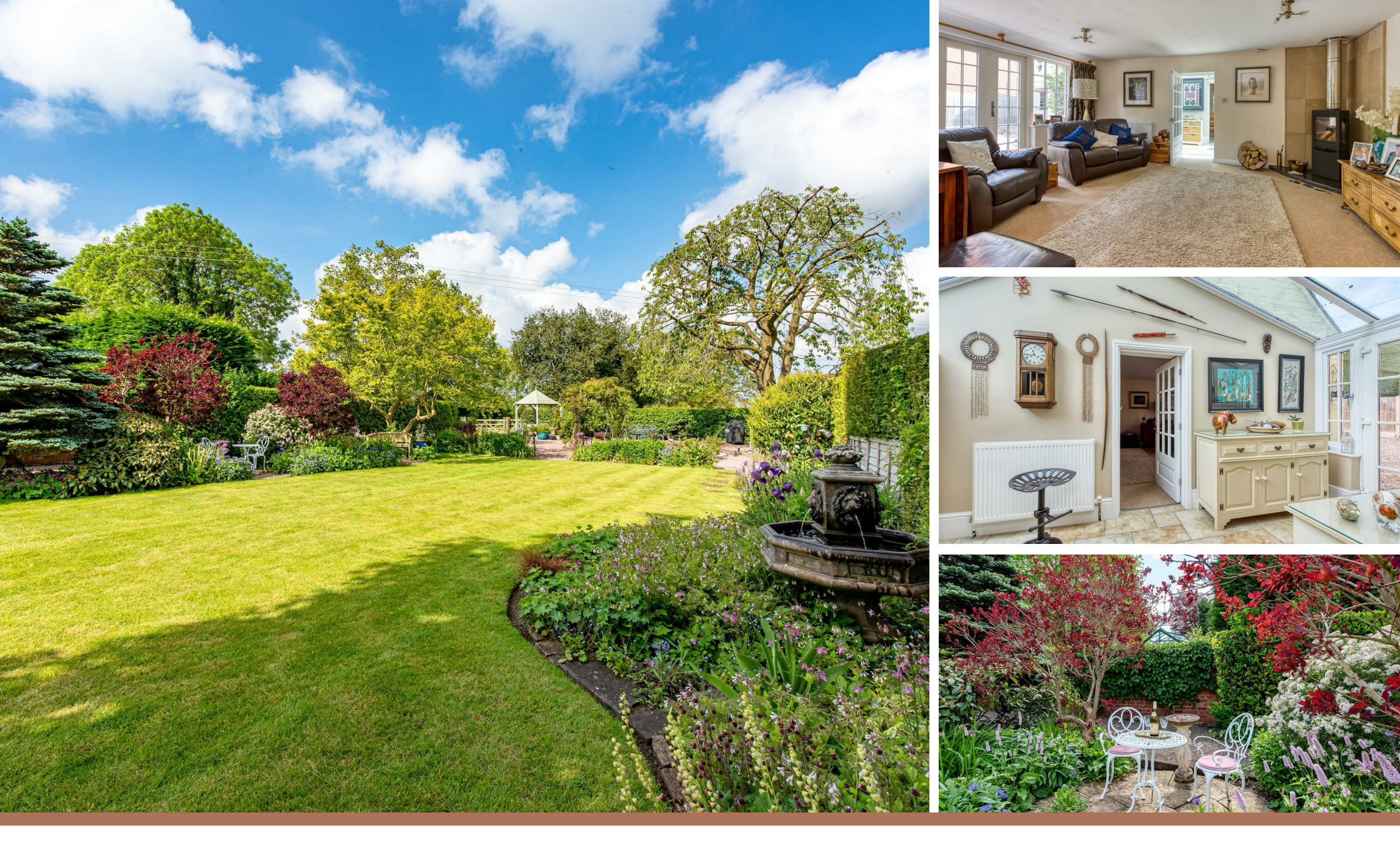
Beckbury House, Beckbury, Shifnal, Shropshire, TF11 9DJ

A Georgian gem, in a pretty Shropshire village, standing in grounds of approximately 1.15 acres with a lovely garden, a paddock, stables and a detached Artists Studio.