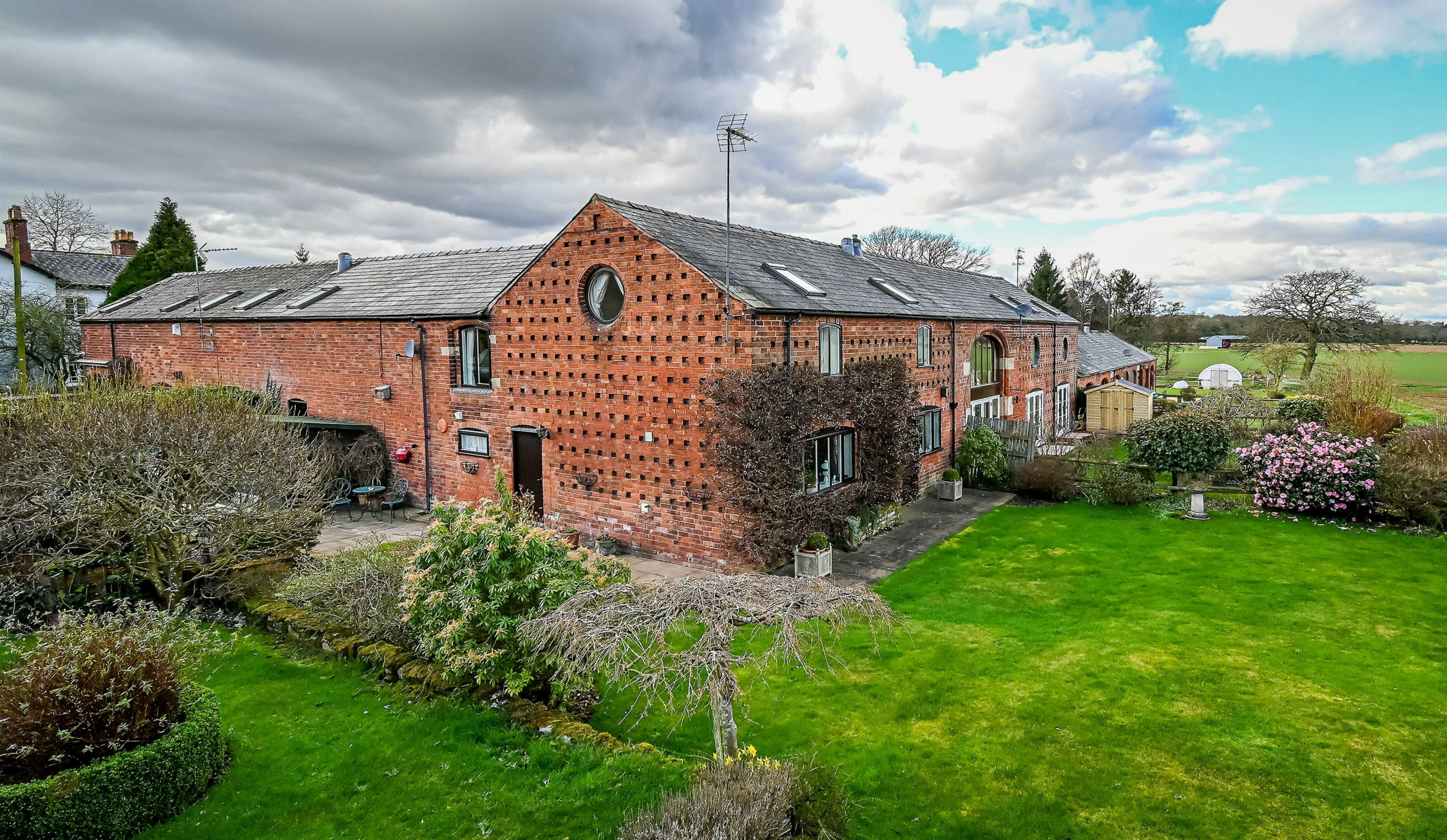
The Oak House, Oaklands Court, Lower Rudge, Pattingham, Shropshire, WV6 7EB