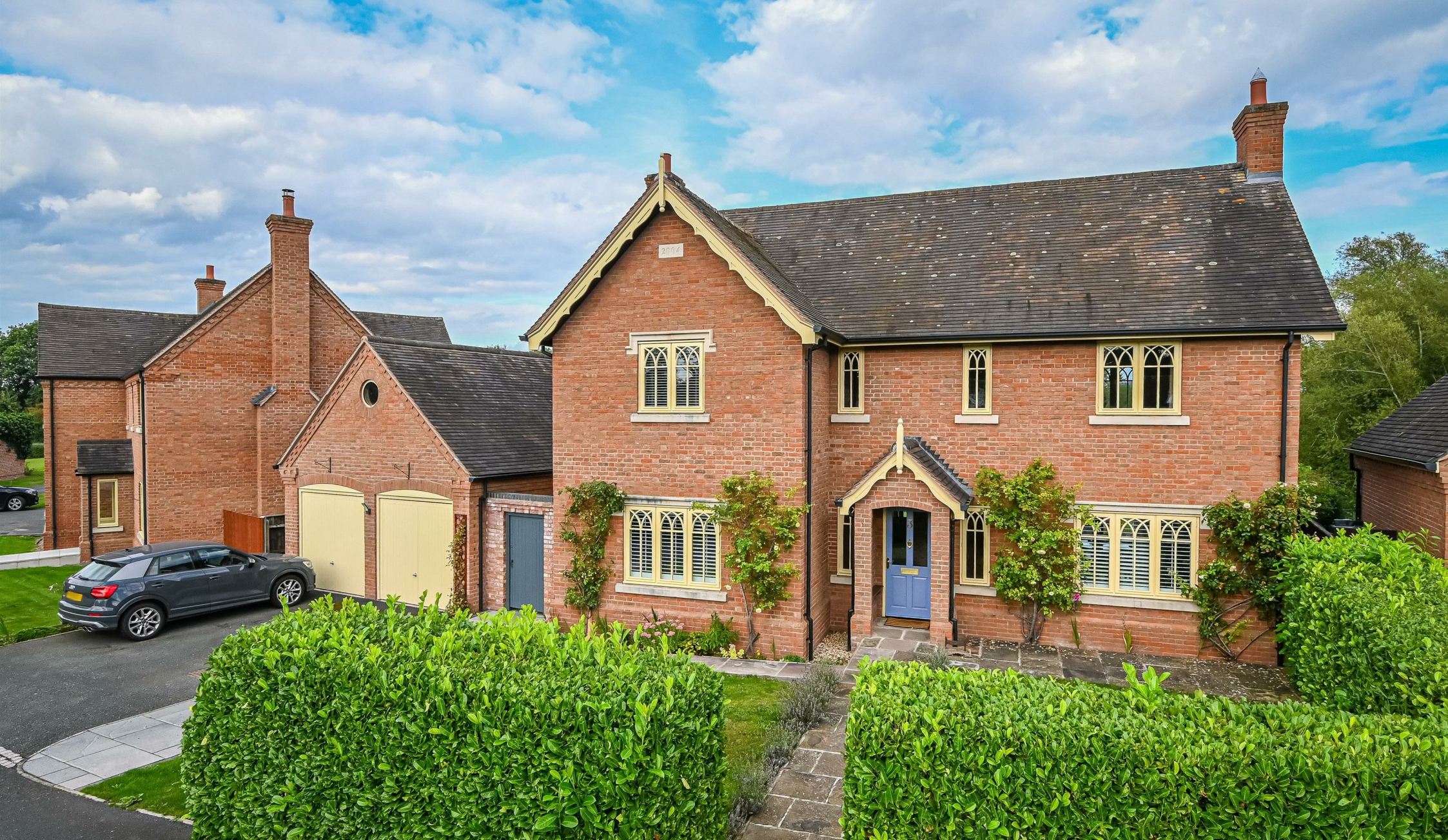
Fitzallen House, 3 Cound Park Drive, Cound, Shrewsbury, Shropshire, SY5 6BN