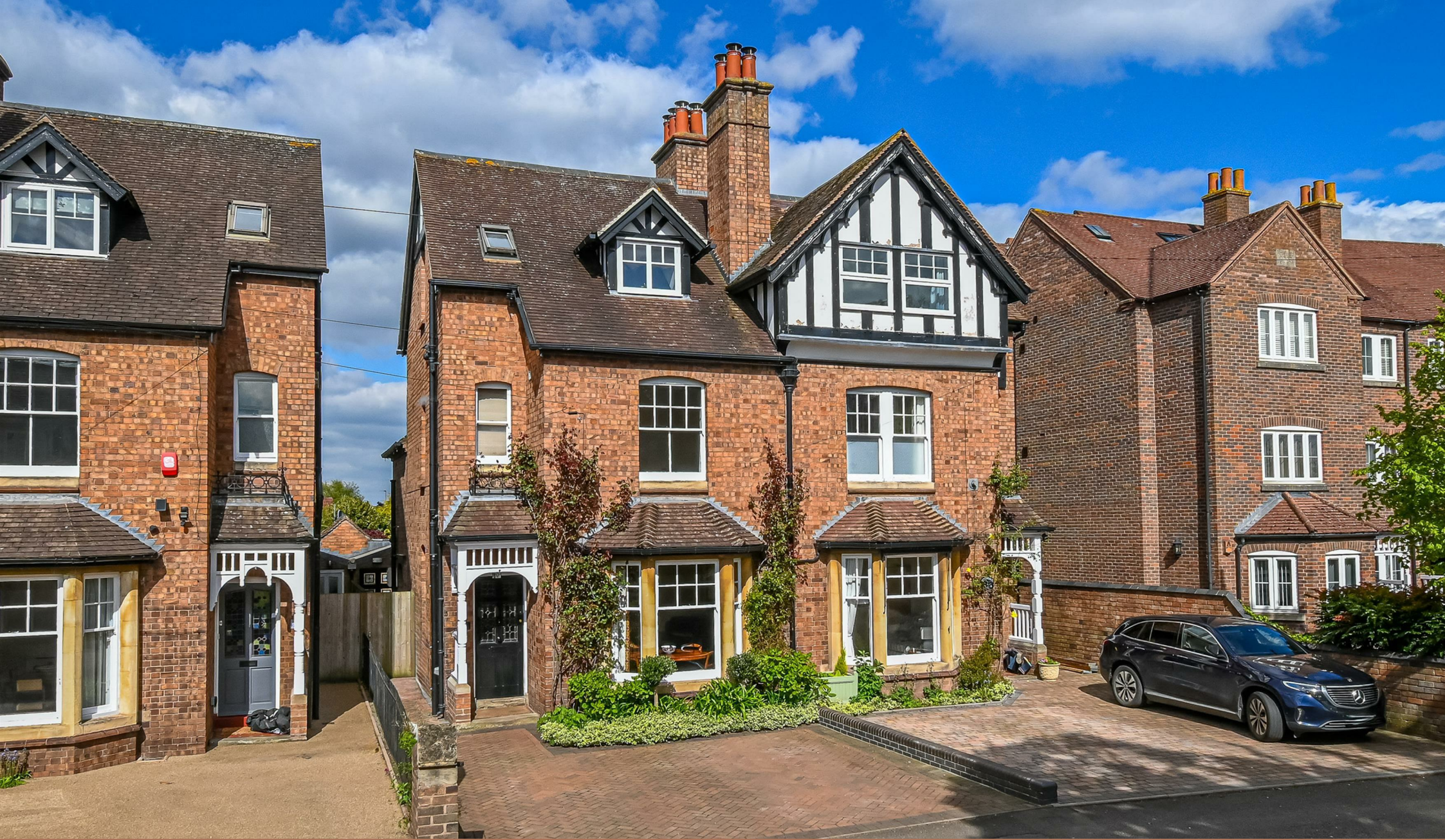
2 Westgate Villas, Salop Street, Bridgnorth, Shropshire, WV16 4QX